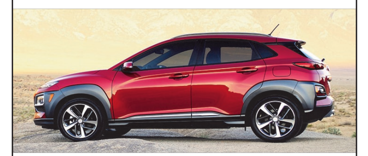
America's Best Warranty